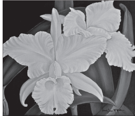
Art by Sarah Jane McMillan

Founded in 1921, the AOS currently has 10,000 members and 600 affiliated societies around the world including groups in South Florida, one of which meets regularly at Fairchild. From its earliest days, the AOS has organized orchid exhibitions all over the country, and in 1949 instituted the highly respected orchid judging system, still in use today, which established the criteria for judging orchids of superior quality. The AOS also publishes the esteemed Orchids magazine, which provides comprehensive, up-to-