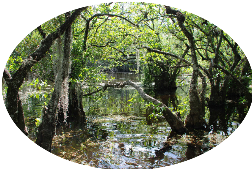
A cypress stand in Big Cypress National Park

Our location, at the crossroads of the temperate and tropical zones, produces a warm sub-tropical climate, with wet, humid summers and cool, dry winters. More species of plants grow here than in northern temperate zones, creating a lush environment, unique in the world. It is a beautiful and exciting place, a home for plants, birds, fish, butterflies, and animals (including humans)!