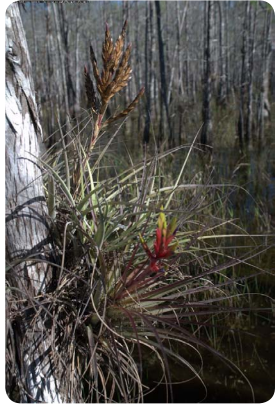
Epiphyte on tree

Understory - the plant layer growing under the canopy, made up mostly of young trees and shrubs.