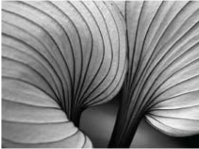
Tacca Bat Plant.