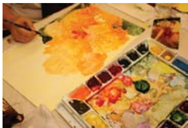
Student in Yupo painting class.