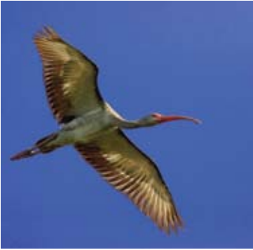
Immature Ibis in flight in the Everglades.

Fee per section: Members, $65; Non-member, $85