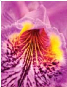
Cattleya orchid.