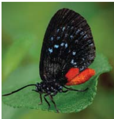
Atala Butterfly.