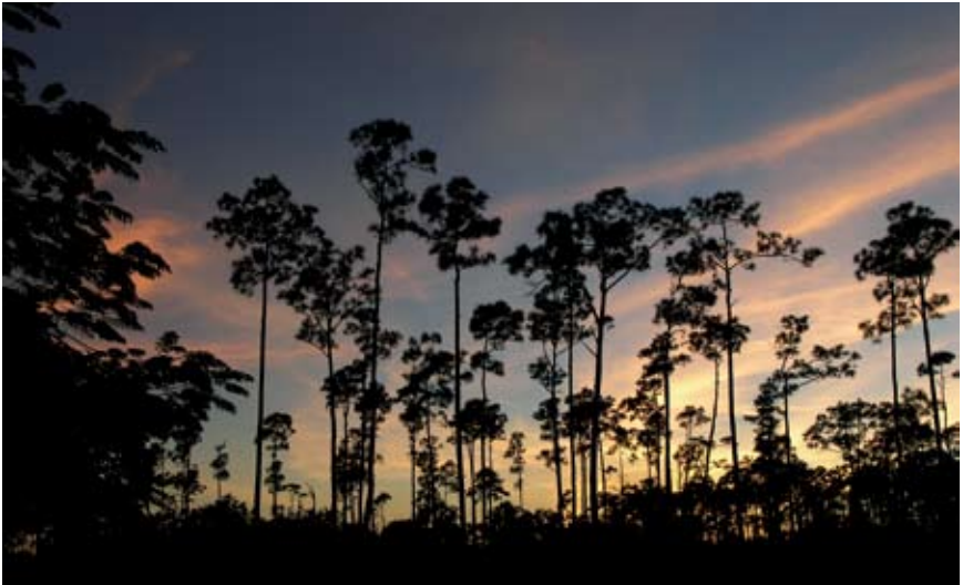
Pine Island Sunset.