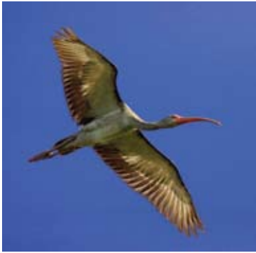
Immature Ibis in flight in the Everglades.

season will offer lectures and classes that focus on the unique habitat of the Everglades. We are delighted to open your eyes to the amazing natural resource comprised of approximately 1.5 million acres of subtropical flora and fauna that is in our backyard: Everglades National Park.