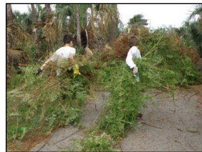
Students removing overgrown Bracken fern at Fairchild Challenge restoration workday

To all those that participated in the Fairchild Challenge restoration workday at Tropical Park several weeks ago, you accomplished an incredible amount of work! The endangered crenulate lead plant, Fairchild Tropical Botanic Garden, and Miami-Dade County thank you!